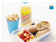
Spicy chicken and salad wrap

If your child really likes their crisps try reducing the number of times you include them in their lunchbox and swap for homemade plain popcorn or plain rice cakes instead.